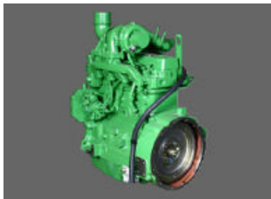
JOHN DEERE ENGINES

OPTIONS INCLUDE: TWO WHEEL TRAILER, FUEL TANK, 12V ELECTRIC PRIMER, PTO CLUTCH WITH FRAME MOUNT PUMPS, AND HIGH/LOW LEVEL OIL SAFETY GAUGE