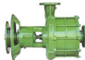
ROVATTI SAE MOUNT WATER PUMP