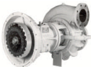
CORNELL SAE MOUNT WATER PUMP