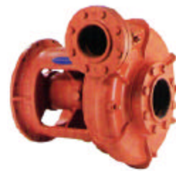
BERKELEY SAE MOUNT WATER PUMP