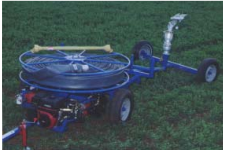
Model 2970H (Other Sizes Available)